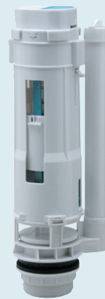
Bottom fill valve P to S trap adapter