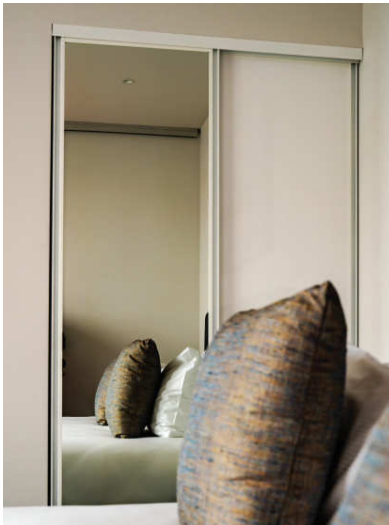
WARDROBE DOUBLE PANEL TWIN TRACK - 1 PREFINISHED PANEL & 1 MIRROR PANEL WITH WHITE FRAME AND TRACK